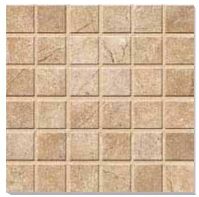
AG58 Burgundy GR Mosaic - Square 2"x2" 13"x13"

20"x20" 13"x13" 6<sup>1/2</sup>"x6<sup>1/2</sup>"