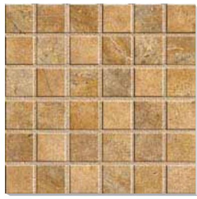
AG59 Burgundy GO Mosaic - Square 2"x2" 13"x13"