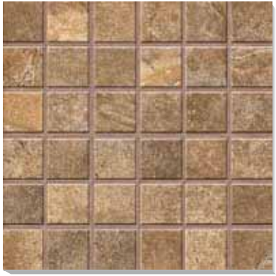
AG6A Burgundy NO Mosaic - Square 2"x2" 13"x13"