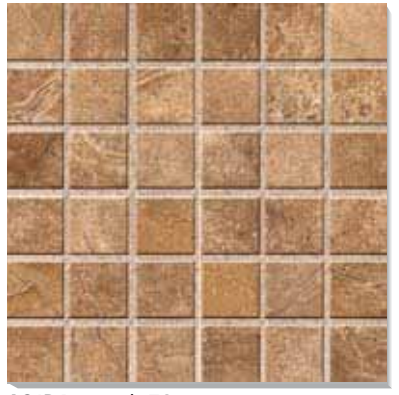
AG6B Burgundy TC Mosaic - Square 2"x2" 13"x13"